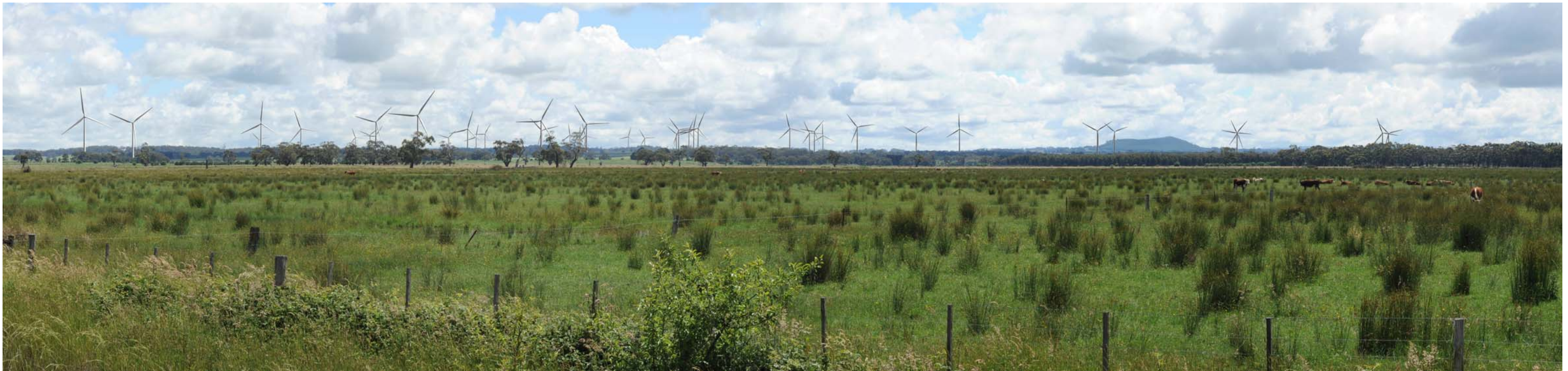
Photomontage of 150m High Wind Turbines