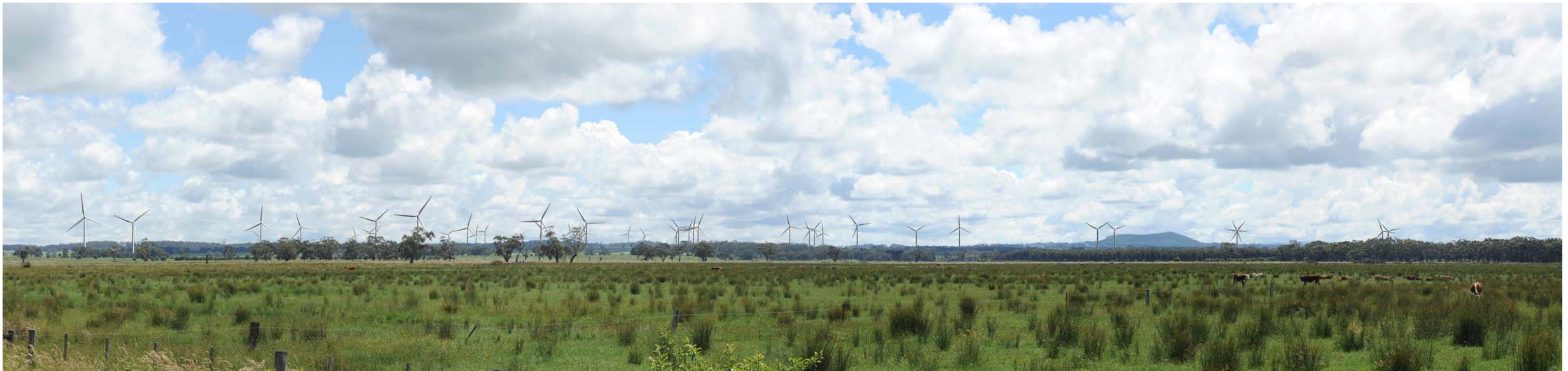
Photomontage of 130m High Wind Turbines